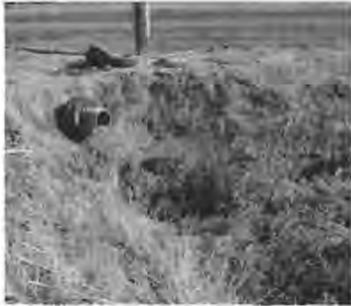
Figure 3. Cantilevered pipe discharge into tailwater pond.

As a rule of thumb, expect the tailwater volume to be 15 to 25 percent of the water applied to an irrigation set. For example, if an irrigation set has a flow rate of 1,500 gallons per minute and is 8 hours long, the expected tailwater discharge (15% of inflow) would be 108,000 gallons ( 1,500 \text{ gal/min} \times 60 \text{ min/hr} \times 8 \text{ hr} \times 0.15 = 108,000 \text{ gal} ). (For metric conversions, see the table at the end of this publication.) This would be 14,440 cubic feet or 0.33 acre-feet of water. A tailwater volume of 25 percent of the irrigation set applied water would be 180,000 gallons (2,060 cubic feet, or 0.55 acre-feet).