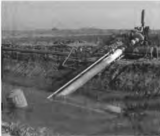
Figure 6. A rotary pump intake screen and diesel engine used for tailwater return.