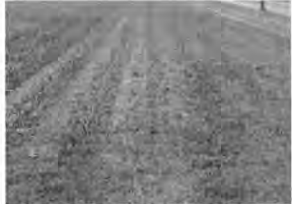
Figure 2. Alfalfa stand loss at end of field due to standing water.