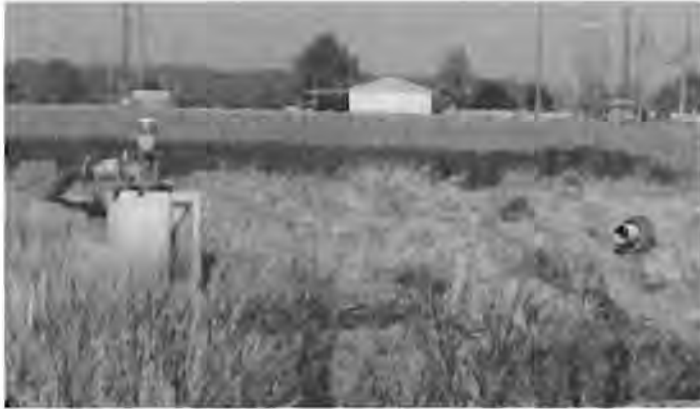
Figure 1. Tailwater collection system.