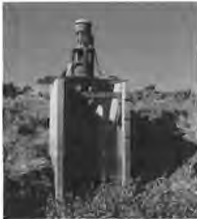
Figure 5. Trash screen on a concrete sump intake box.