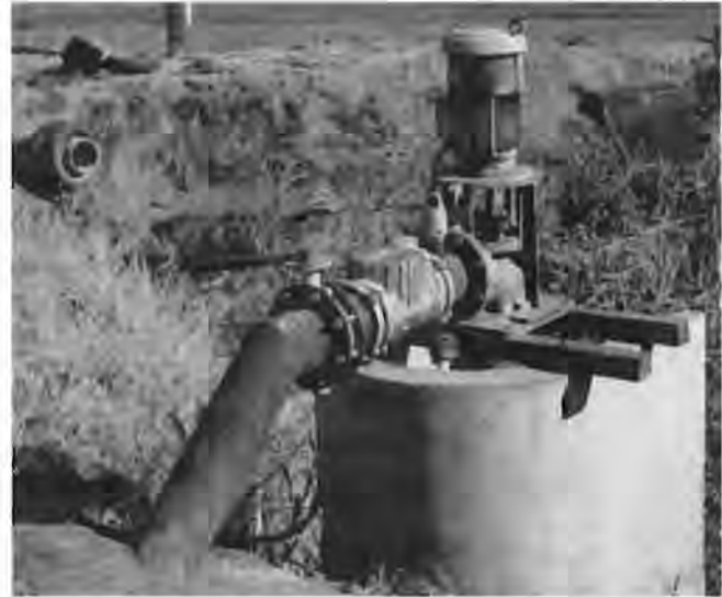
Figure 7. Control (butterfly) valve, air-vacuum relief valve, and check valve located downstream of tailwater return pump.